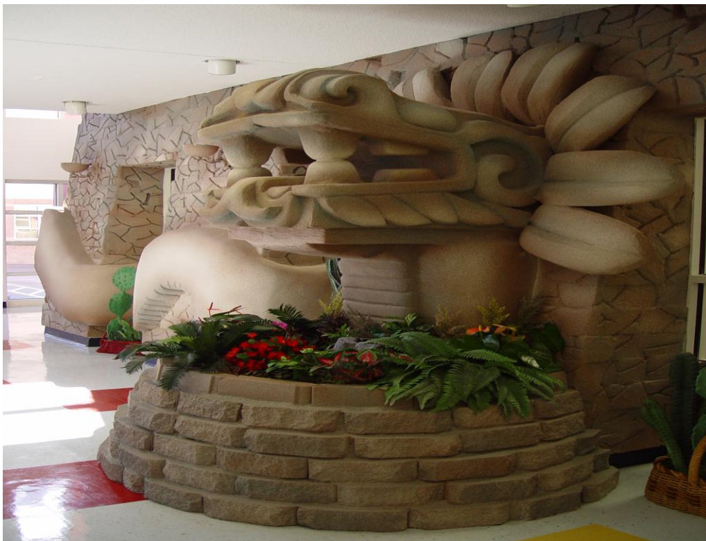
Quetzalcoatl Warrior and Wisdom

La Fe Policy Research and Education Center works to continually improve the bienestar (well-being) of Mexican Americans through policy analysis, education, leadership development, civic involvement and advocacy. Bienestar affirms our culture, community experience, and values to achieve equality of opportunity through responsive social and health policies. La Fe PREC is part of the Centro de Salud Familiar - La Fe (La Fe), organizational family based in El Paso, Texas. La Fe has over 40 years of social justice, advocacy and direct service delivery experience in health, education and training, cultural arts, and economic development.